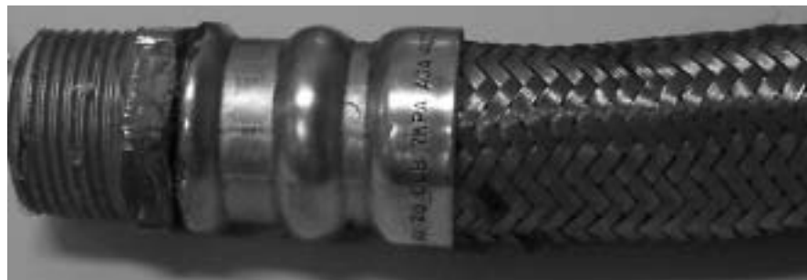
Approved flexible hose connection with requisite markings